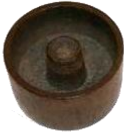
Codd Bottle Opener

introduced to return the empty bottles to their rightful company. In 1880, Codd introduced the idea of a bottle exchange in London. This was slow to start, but eventually caught on and spread throughout England. As a result, thousands of empty bottles could be returned to their rightful owners via the bottle exchanges, who charged a small fee on each bottle for providing this service (1 penny [old] per gross of bottles). This dramatically lowered the cost of bottled mineral water to consumers.