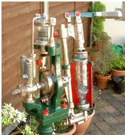
Antique Codd Bottle Filler