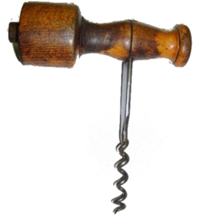
Codd Bottle Opener

Codd passed away on February 18, 1887 at his family home, Suffolk Lodge, 162 Brixton Road, Brixton, London from "congestion of the brain and chronic disease of the liver and kidneys" and is buried in London's Brompton Cemetery.