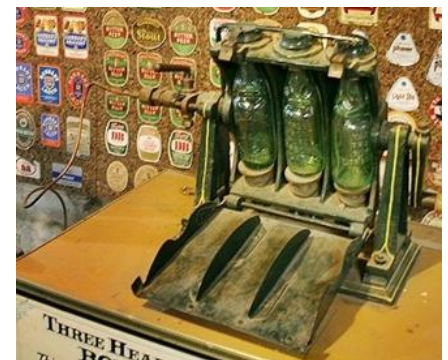
Antique Three Bottle Filler